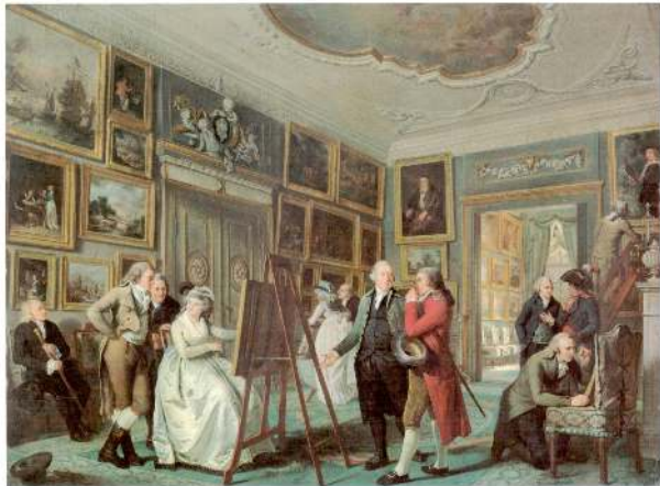
Adriaan de Lelie The art gallery of the Golden Chamber facade, on the Herengracht in Amsterdam, 1790-1795. Rijksma- ceus, Amsterdam At top left is Bakhuizen's painting.