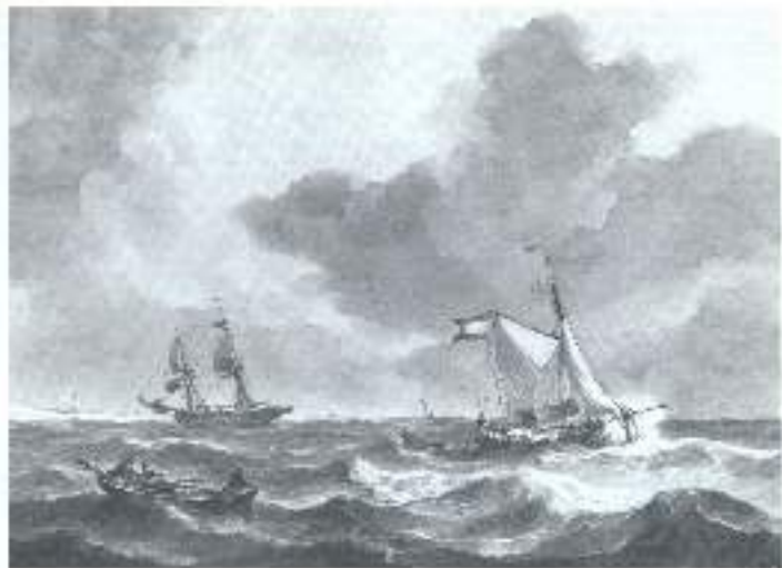
THE GREAT SEA By J.M.W. Turner Shipping in the Bay of Naples

Reproduction of the painting by the artist J.M.W. Turner, showing the sea in a stormy state. The painting is titled "The Great Sea" and is a reproduction of the original work by the artist J.M.W. Turner.