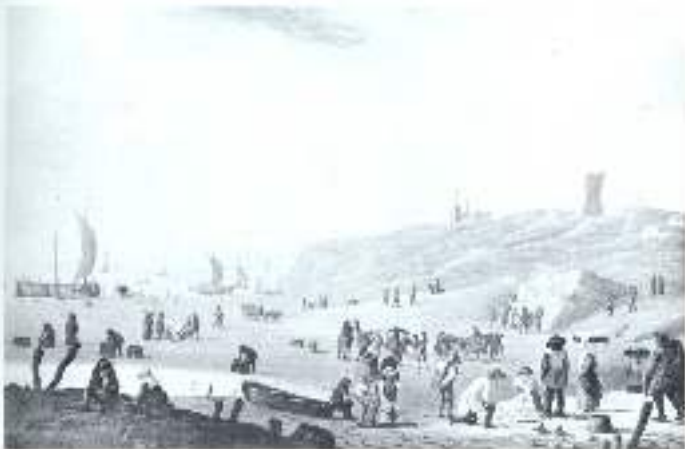
Illustration of the harbor of the city of New York, showing the harbor, the city, and the surrounding hills, as seen from the water, in the year 1875. The harbor is filled with ships, and the city is visible in the background. The illustration is a black and white engraving.

Illustration of the harbor Illustration of the harbor